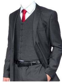
Suit Protection Vest