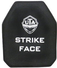
Hard & Soft Armor