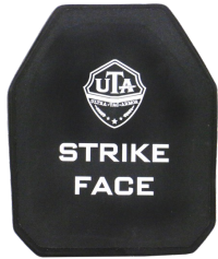
Hard & Soft Armor